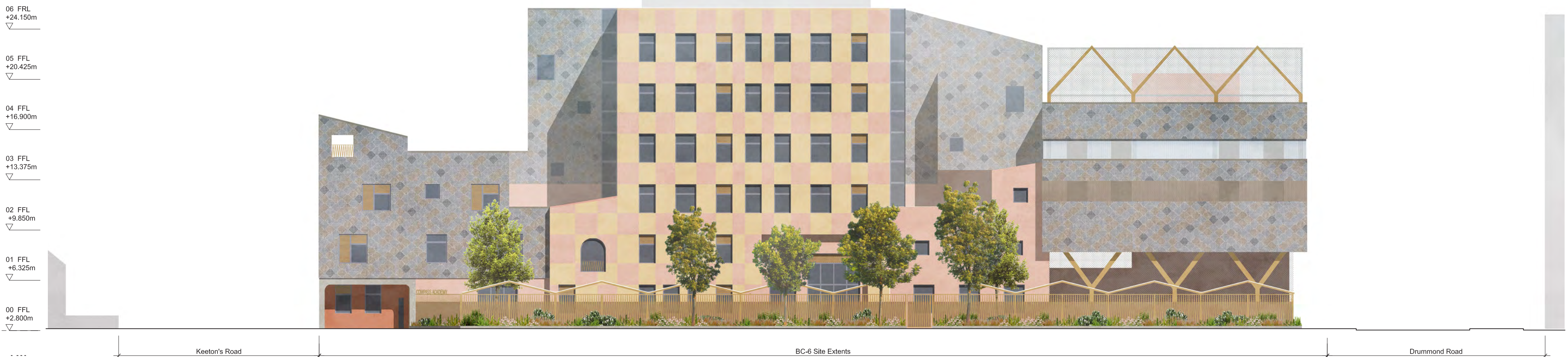
B(ii) : SOUTH ELEVATION: SCHOOL LINK