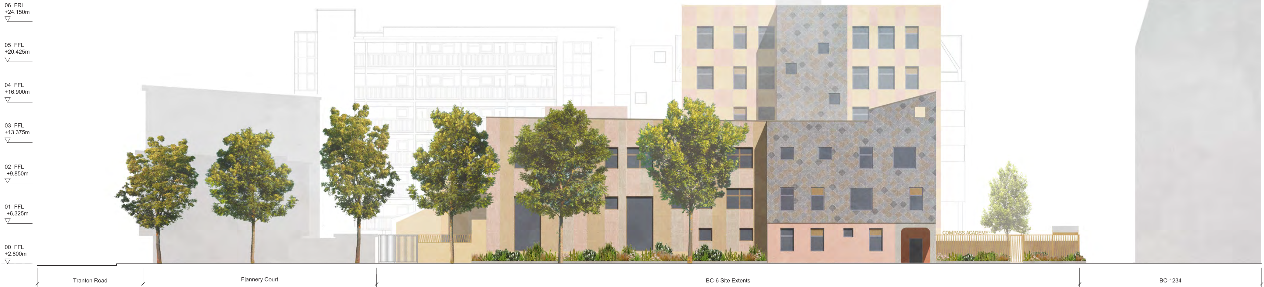
A : WEST ELEVATION: KEETON'S ROAD