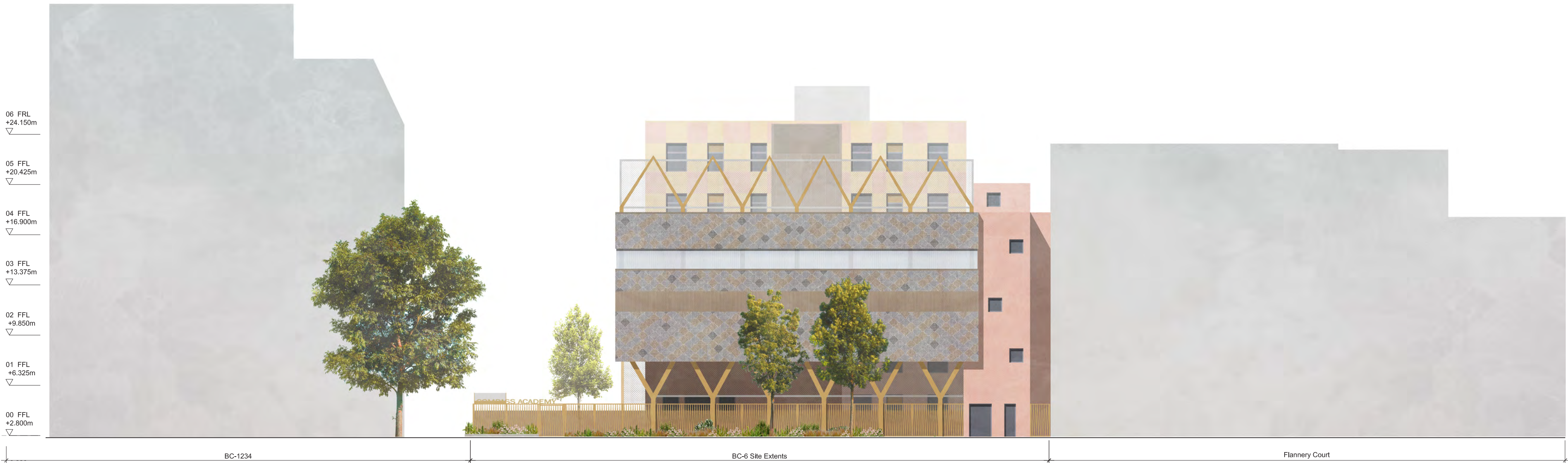
C : EAST ELEVATION: DRUMMOND ROAD